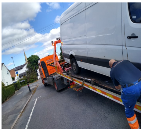
Vehicle recovered from Grove Road following resident complaint (No Tax)

Targeted patrols where we identified criminal opportunities. We completed patrols in multiple areas and engaged with residents to raise awareness.