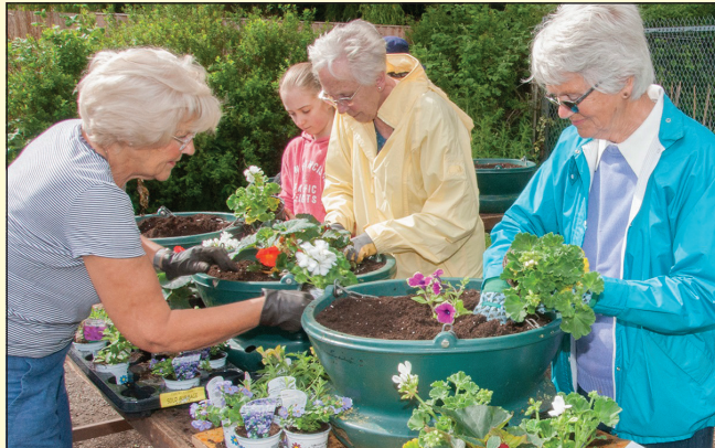
Burbage Gardening Club members are preparing to re-plant the baskets they potted up in spring

Hanging baskets across the parish are to be taken down at the beginning of October and re-planted for the winter months by members of Burbage Gardening Club, who carry out the work on behalf of the Parish Council.